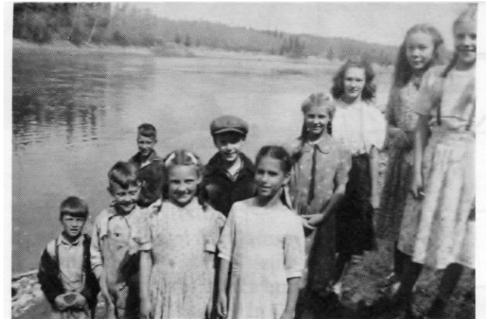
Otter Creek school children on a picnic, 1950.